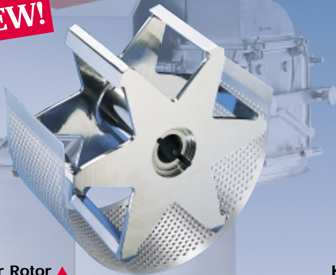
Bar Rotor ▲