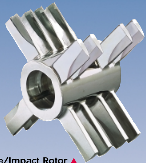
Knife/Impact Rotor ▲

The new bar rotor is interchangeable with the classic Fitzmill® knife/impact rotor to provide an extremely versatile size-reduction unit with ultimate process flexibility.